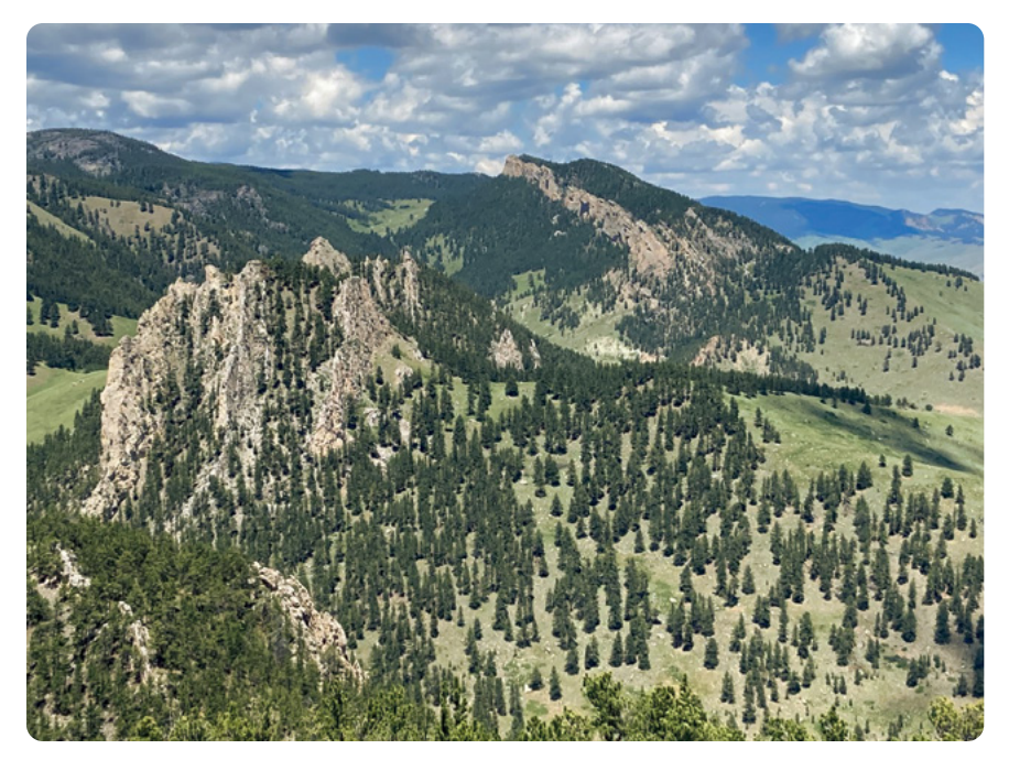
View to the north of the hanging wall of the Clear Creek Thrust east of Buffalo, Wyoming.