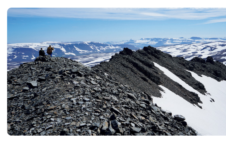
Enjoying the mountaintop halfway through a 12-mile roundtrip sampling excursion in eastern Iceland.

Analytical work for both projects is pending, and students hope to present their findings in spring 2022.